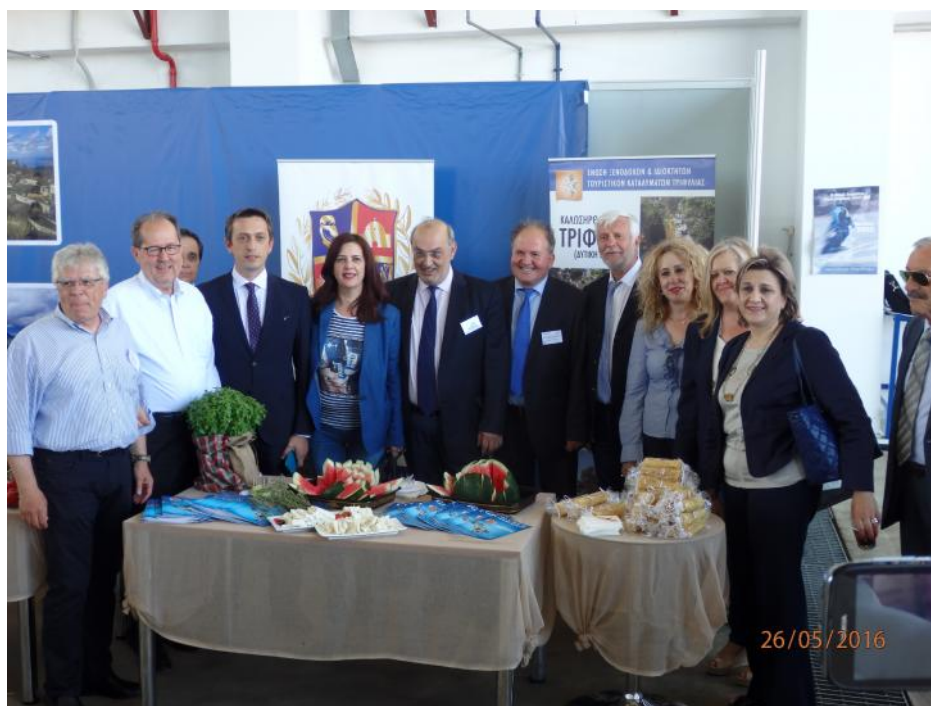
(Local Officials and Messinia delicatessen Products)

Participation only with prior personal invitation and security admission For more information or participation or sponsoring opportunities contact iForce Communications at info@iforce.gr