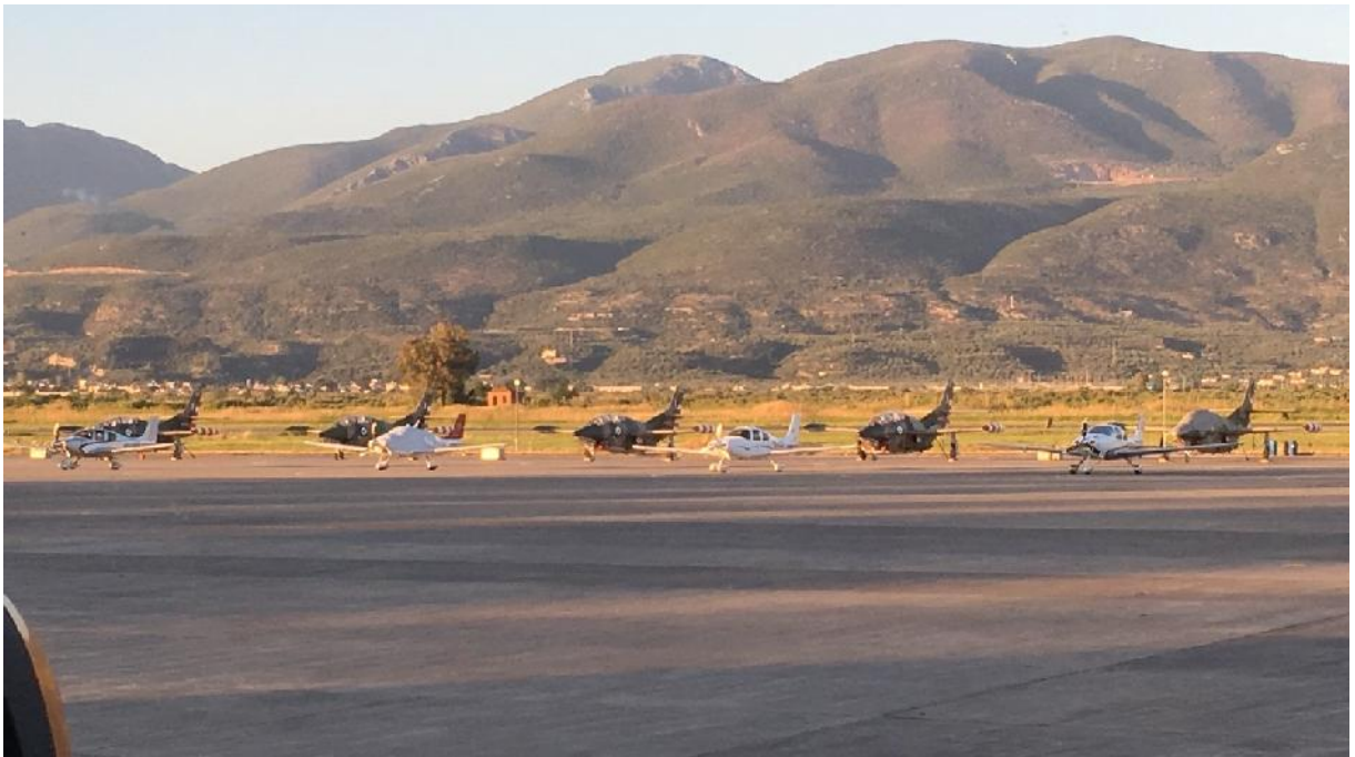
(Civil and Military Airplanes stationed in 120 ATW Kalamata, Greece)