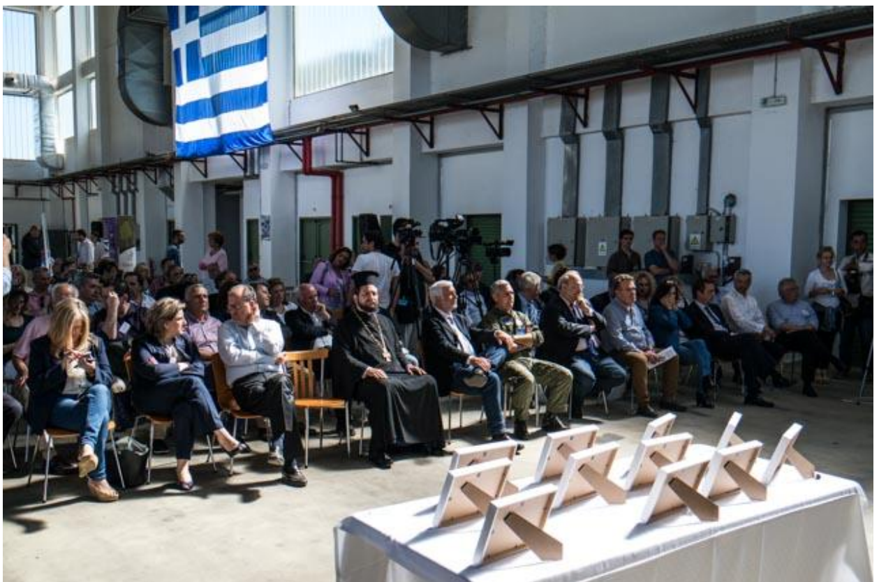
(Greeting reception and Award of Commemorative Plaques)